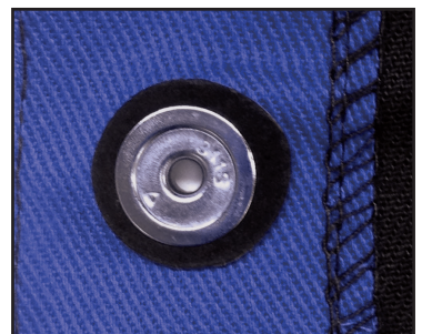
DURABLE LEATHER REINFORCEMENTS on the back of all snaps