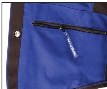
ZIPPERED INSIDE POCKET keeps phone and other small items safe and secured