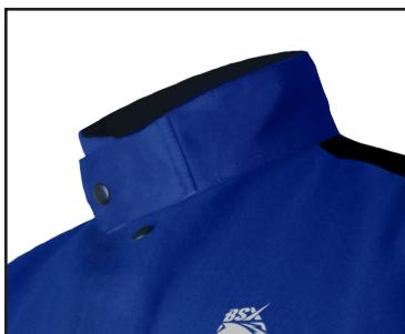
STANDUP WELDER'S COLLAR for better neck protection