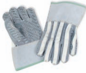
Style 4" Gauntlet w/ Heavy Nylon Strips