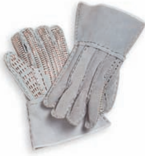
Style 4" Gauntlet Part # 1644 (shown)