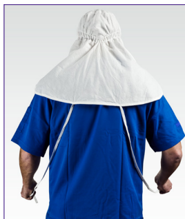
Clean-Don* ties for easy donning and a more secure fit