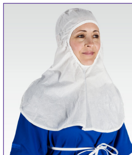
Great for small faces