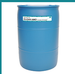
54-gallon drum SKU: CLAMO-54G UPC-12: 641238039310