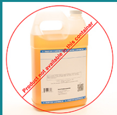
1-gallon jug SKU: CLEANAMO-1G UPC-12: 641238070764