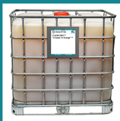
270-gallon tote SKU: CLAMO-270G UPC-12: 641238069195

Master STAGES™ CLEAN AMO™ | ©2004-2025 Master Fluid Solutions® | 2025-06-23