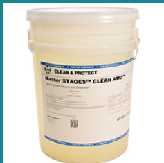
5-gallon pail SKU: CLAMO-5G UPC-12: 641238039280