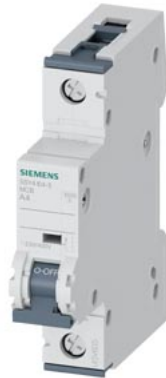
Miniature circuit breaker 230/400 V 10kA, 1-pole, A, 4A, D=70 mm